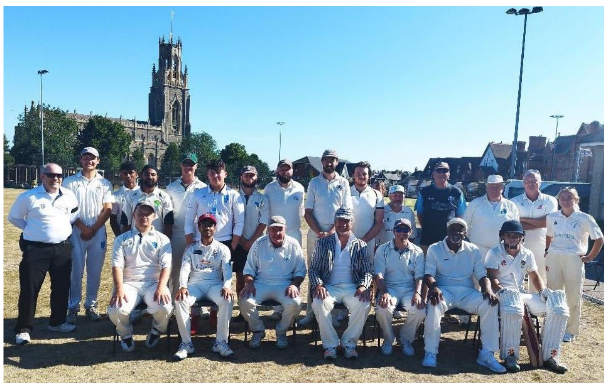
The two teams come together for a group photo at tea.