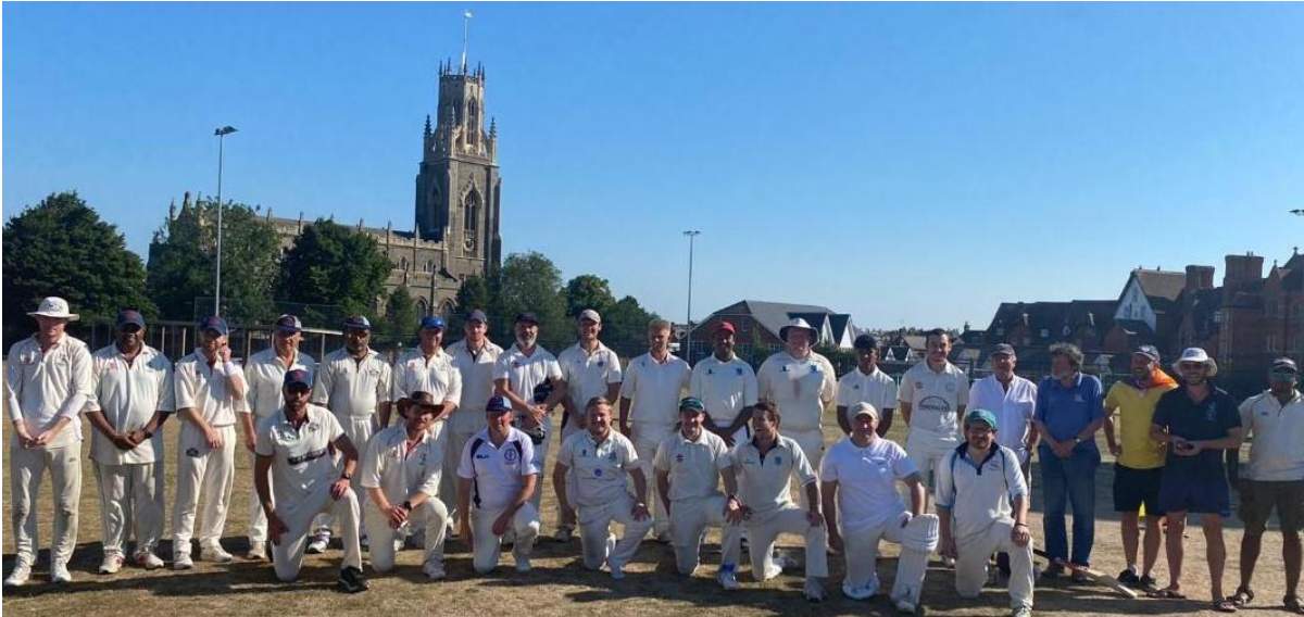
At tea, the two sides from Friday enjoy a brief respite, before returning to the action